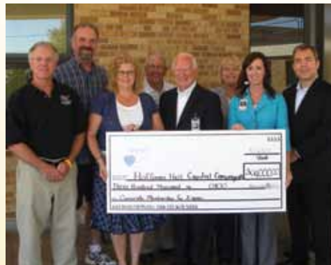
Prairie du Chien Memorial Hospital